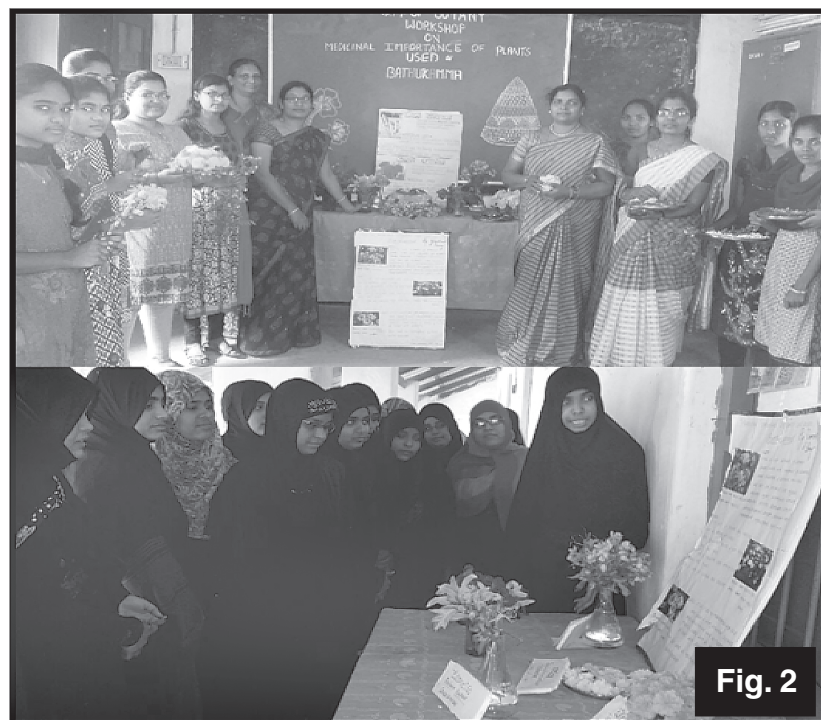
Figs.1 & 2 : Preparation & Celebration of Bathukamma in the College by Students & Botany Staff